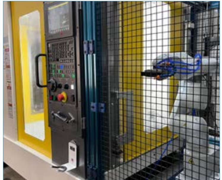
ONTAKT ADDING AUTOMATION

OnTakt's real-time data increases the productivity of your shop by reducing machine downtime. Capturing all of your production data over time also allows you to historically review performance and highlight opportunities to add additional automation or equipment to get more out of your existing machines. Looking for patterns in historical data can lead to rapid ROIs for machines with poor run quality or that require significant manpower to run. OnTakt makes it easy to access historical data to define automation projects and provide the data necessary to calculate the ROI for an improvement to your shop.