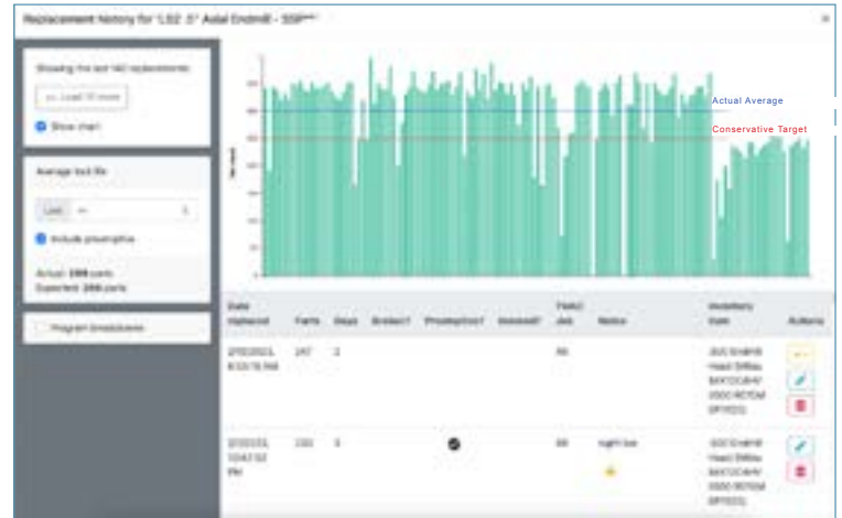
ONTAKT CONSERVATIVE TOOL TARGETS

OnTakt and TMAC from Caron Engineering are designed to be tightly integrated. Leveraging data from both systems simultaneously leads to significant savings on tooling. In our own production shop we are able to safely push tools further into their tool life by using TMAC to stop machines when tools wear or break prematurely. By pairing TMAC with tool life data tracked and recorded in OnTakt, we can easily identify trends to decide when to look into poorly performing tools or identify process changes that need attention. This type of data is often lost on a shop floor. But presenting it clearly, to all levels of an organization, can lead to significant cost savings with rapid ROIs. OnTakt and TMAC will rapidly pay for themselves after finding even one tool that could benefit from more aggressive tool life.